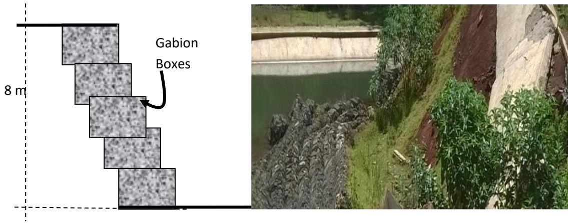
a) Section of an 8 meter high wall