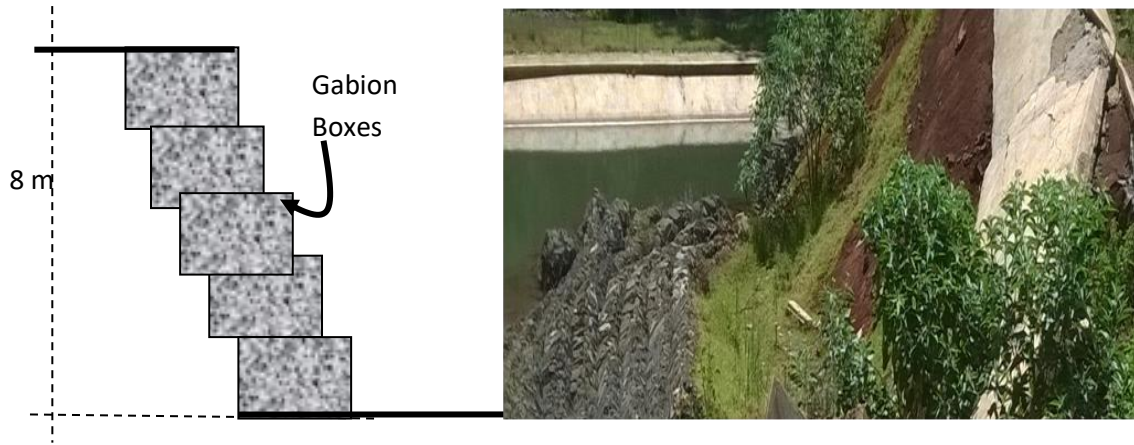
a) Section of an 8 meter high wall